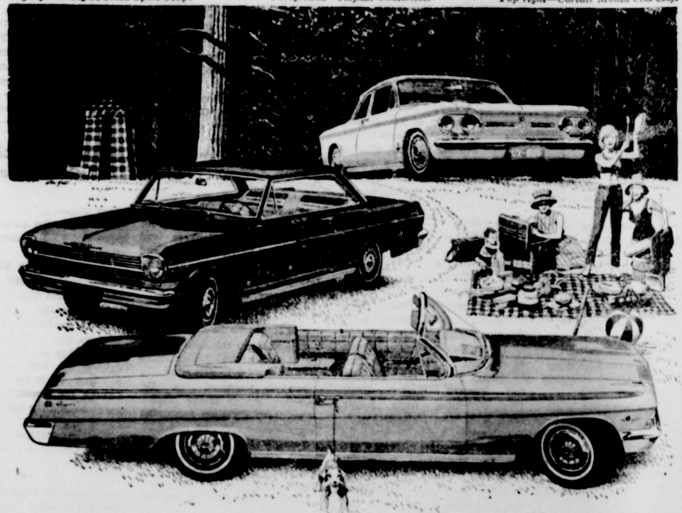
Top left—Chevy II Nova Sport Coupe Foreground—Impala Convertible Top right—Corvaire Monza Club Coupe

YOU'LL FIND JUST THE CAR AT JUST THE PRICE AT YOUR CHEVROLET DEALER'S ONE-STOP SHOPPING CENTER!