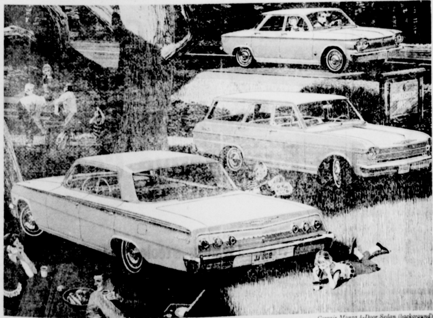
Chevrolet Impala Sport Sedan (foreground) Chevy II Nova 4-Door Station Wagon Corvair Monza 4-Door Sedan (background)

Not just three sizes... but three different kinds of cars... Chevrolet!