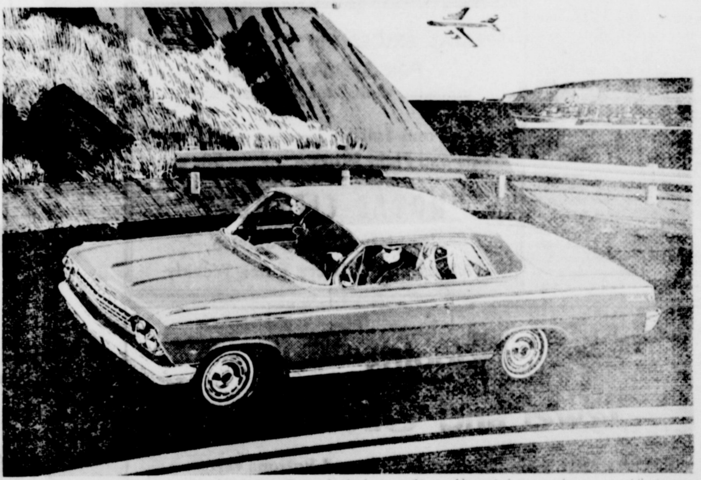
Impala Sport Coupe—here's about everything you'd expect of an expensive car—except the expense.

Your Quality Buick Dealer In Sanderson Is: McKnight Motor Co. HIGHWAY 90