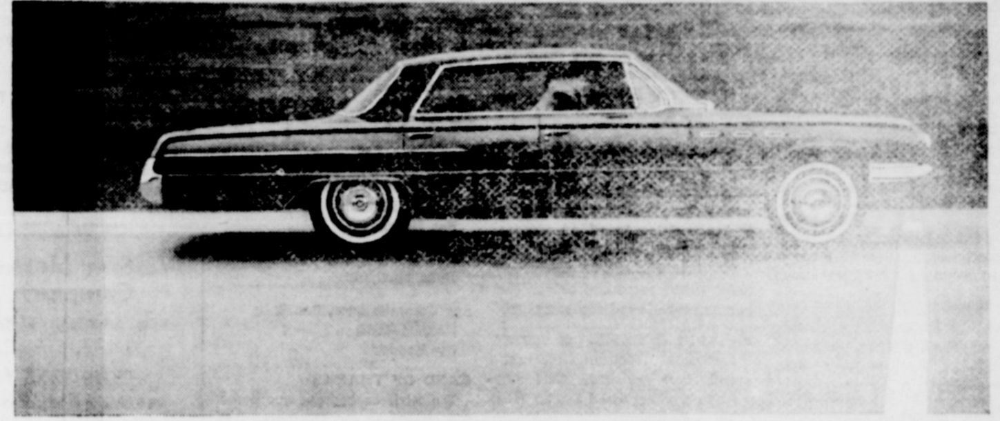
Buick LeSabre gives you the world's best STOP