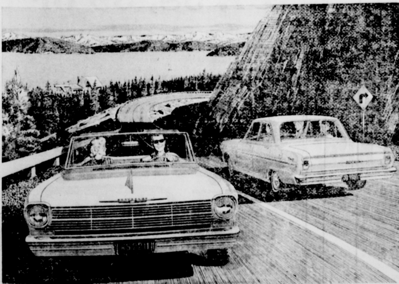
The sporty Chevy II Nova Convertible and sprightly 4-Door Sedan

See the new Chevy II at your local authorized Chevrolet dealer's