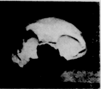
MAN OR APE? — The skull in the picture above was taken out of a cave in Terrell County by a local man who was digging for Indian artifacts. Along with the skull were some bones thought to be arm or leg bones and a skull plate much bigger than the skull shown above. The bones were found buried under rocks and apparently had not been covered accidentally.