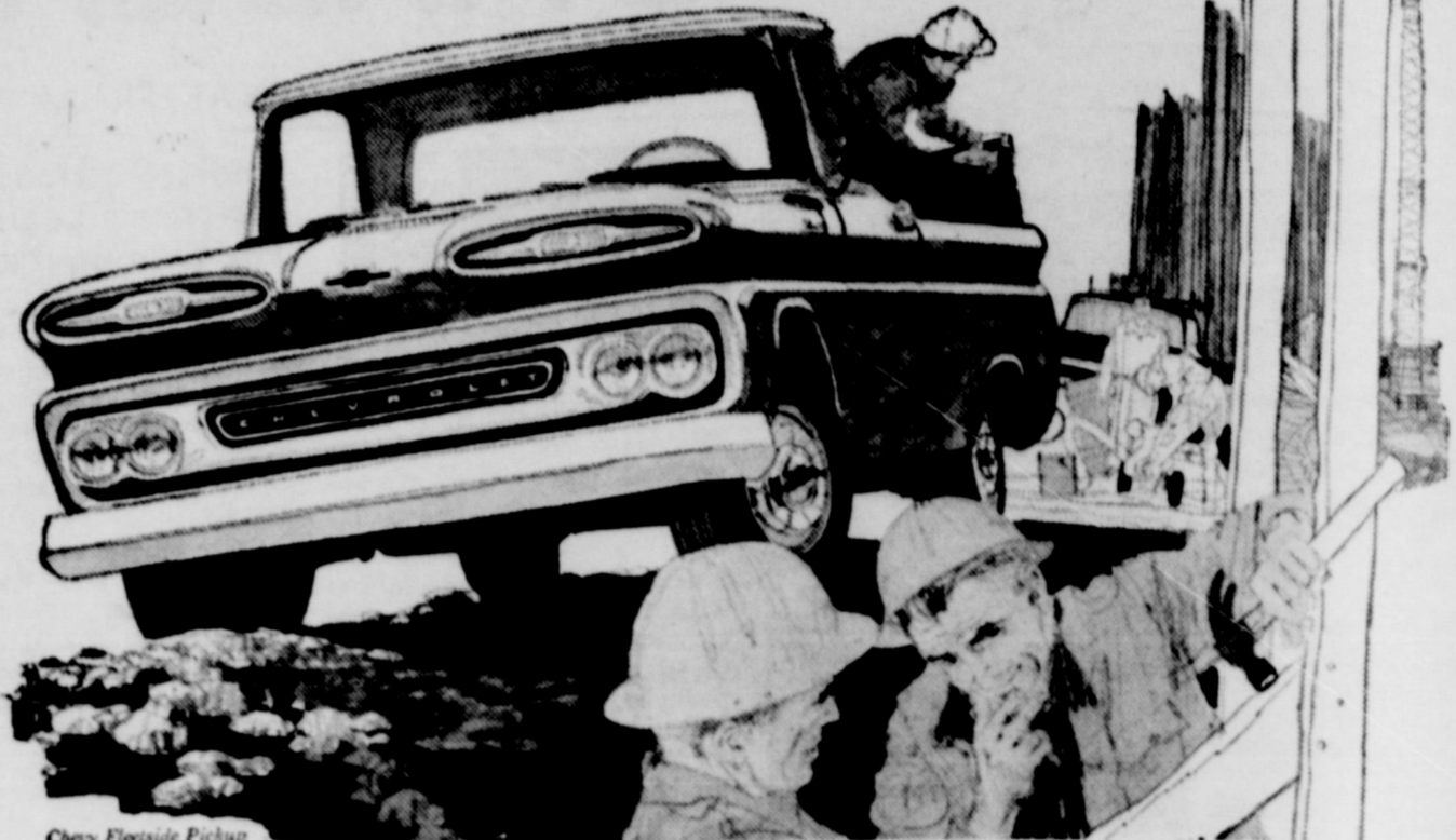
Chevy Fleetside Pickup

You'll get the best buy on the best selling brand at your Chevy dealer's Truck Roundup!