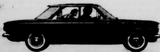
Corvair 700 4-Door Sedan

See your local authorized Chevrolet dealer for economical transportation