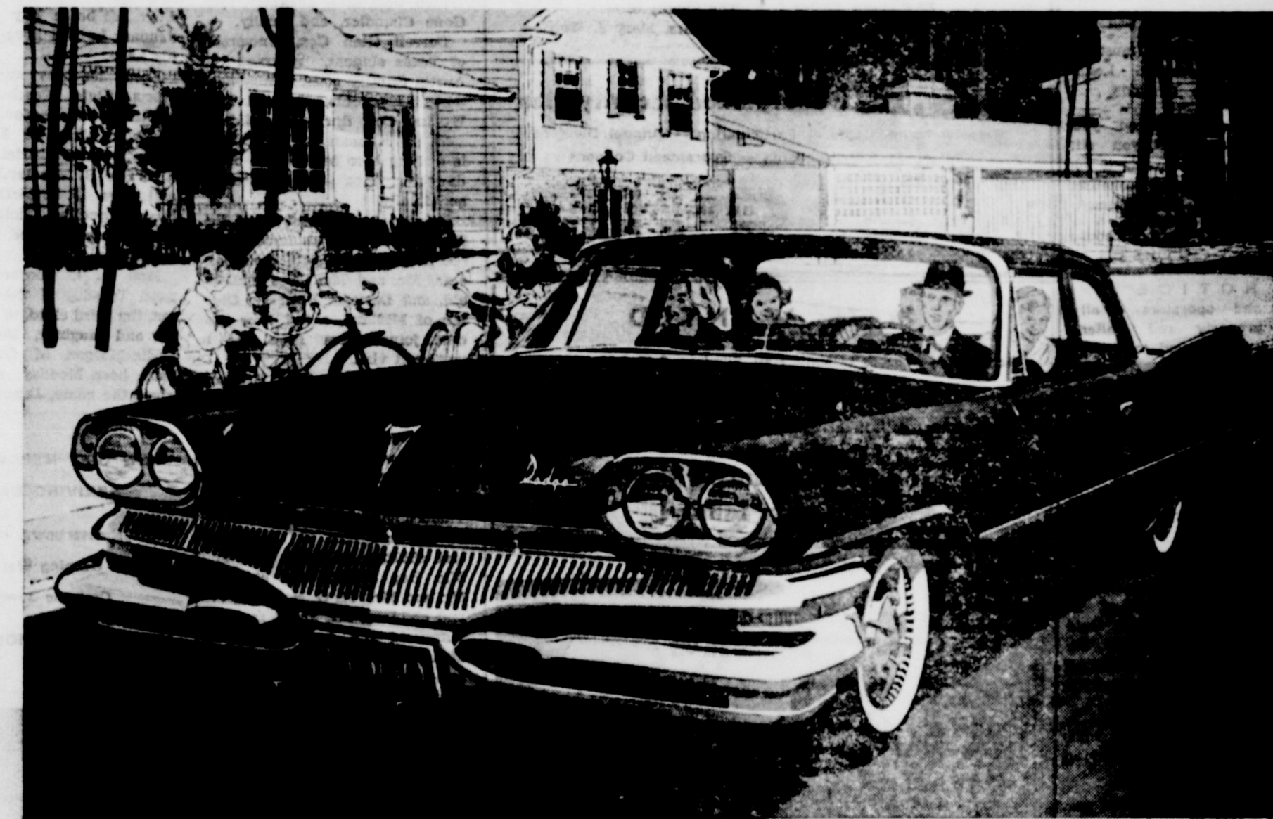
Thrifty Seneca sedan-one of a complete new line of economy cars in the low-paics field.