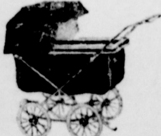
THE NEWEST IN STROLLERS Designed for baby's comfort and this one can be compactly folded. In gay colors.