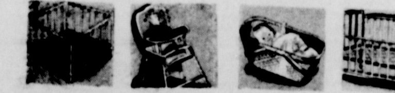
Folding playpens, folding metal high chairs, training seats and chairs. Bassinets, baby scales, bathinets, plastic bath tubs, diaper pails. Save on everything you need for baby's room in our juvenile department.