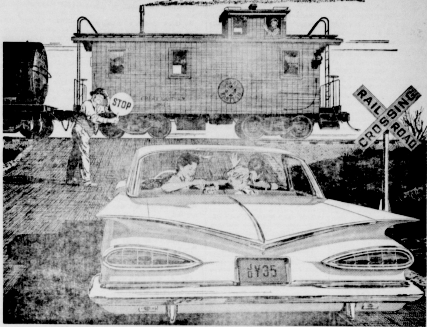
Impala Sport Coupe—like every Chevy—has Safety Plate Glass all around.