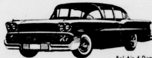
Bel Air 4 Door Sedan