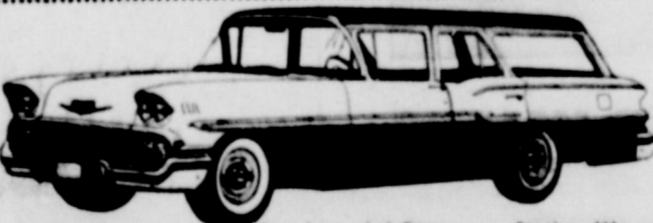
Brookwood 6 Passenger Station Wagon