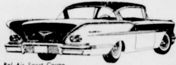
Bel Air Sport Coupe