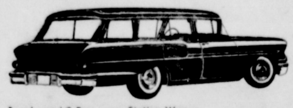
Brookwood 9 Passenger Station Wagon

See your local authorized Chevrolet dealer