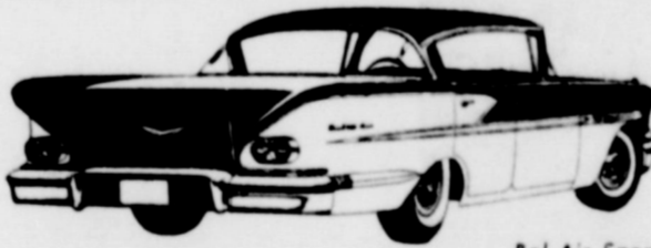
Bel Air Sport Sedan