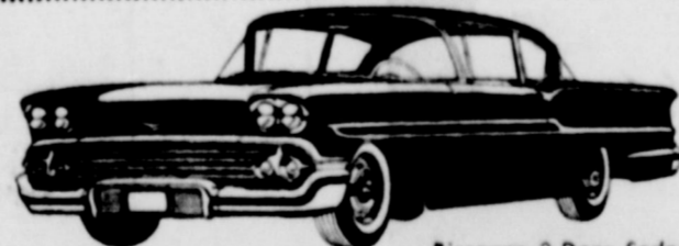
Biscayne 2 Door Sedan

The only all-new car in the low-price field.