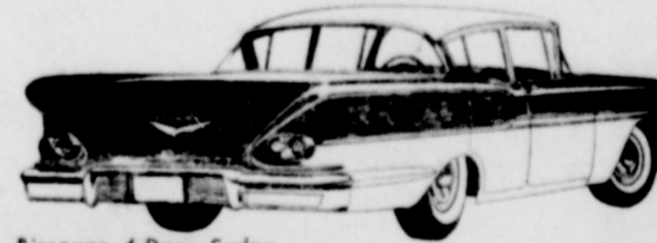
Biscayne 4 Door Sedan