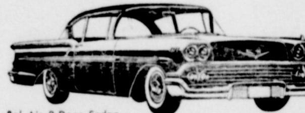
Bel Air 2 Door Sedan