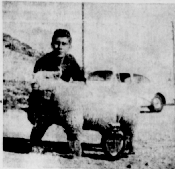
Pictured above are the grand and reserve champion lambs of the first district and eighth annual Terrell County Livestock Show sponsored by the County