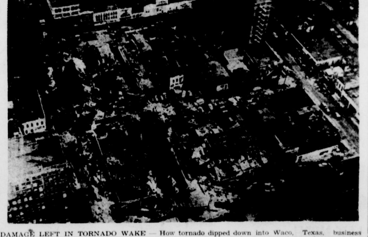
DAMAGE LEFT IN TORNADO WAKE — How tornado dipped down into Waco, Texas, business center, wrecking Dennis furniture store and other buildings, is seen in aerial photo. Death toll was well over 100 in Waco and San Angelo.