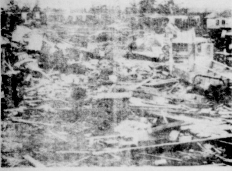
SCORE KILLED BY GEORGIA TORNADO — Levelled homes and tumbled possessions of victims are left in wake of tornado that swept through Warner Robins, Ga., killing a score of persons, injuring a hundred and doing $10,000,000 damage.