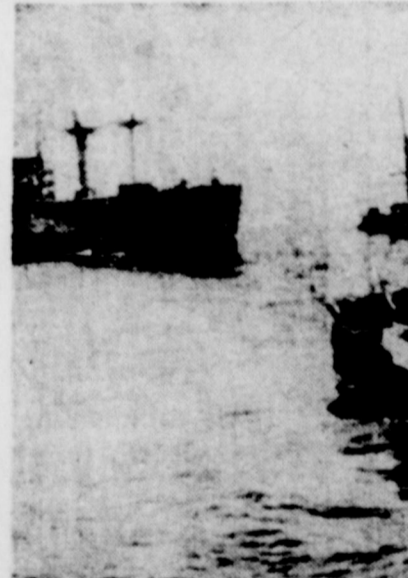
500 SAVED AS SHIPS COLLIDE — In an epic of seamanship, more than 500 were saved when American freighter Haiti Victory (left) sliced back off British steamer Duke of York (right) off Harwich, England. Five, trapped in the vessel, lost lives. Duke resembles half a ship following crash in fog.