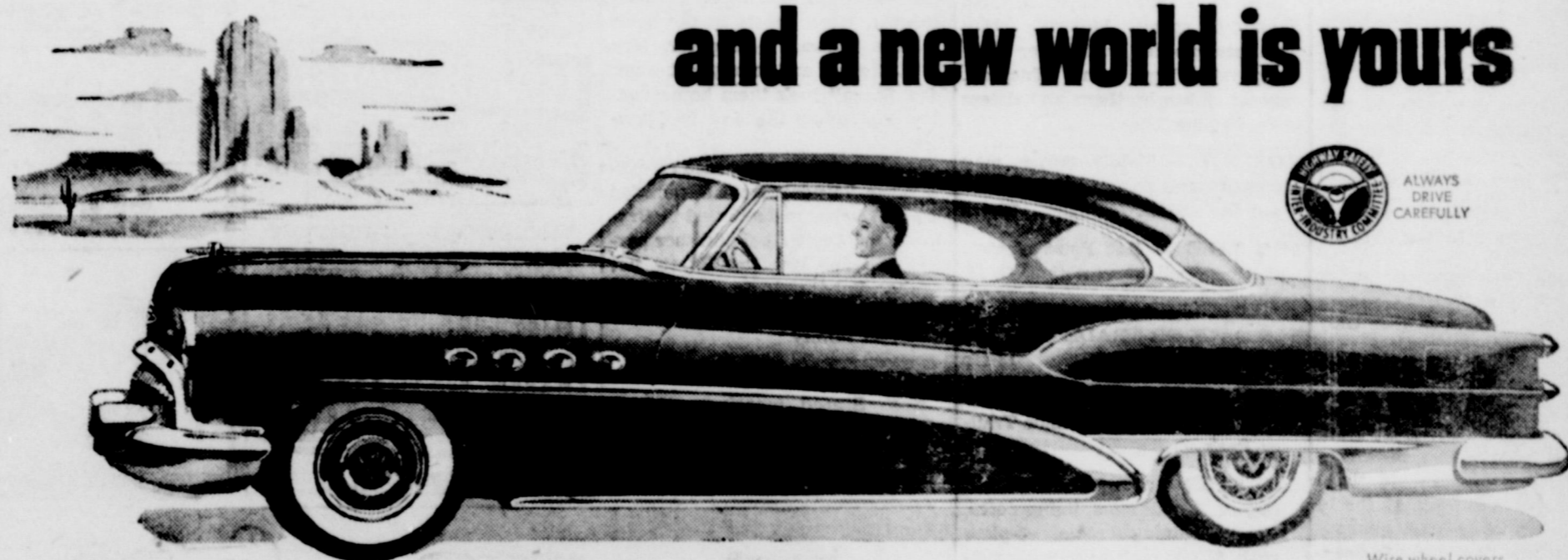
Wire wheel covers, as illustrated, available at extra cost.

Two things stand out above all others in this Golden Anniversary ROADMASTER.