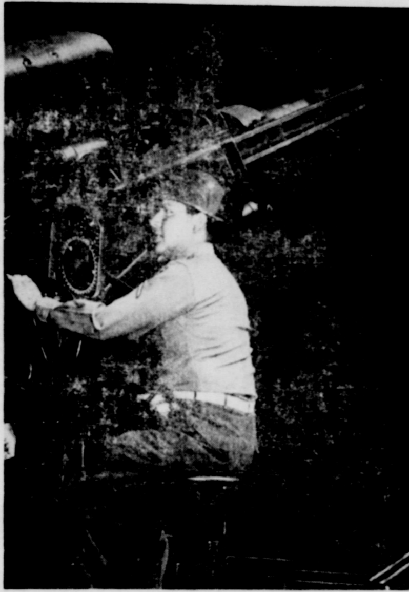
Local Soldier in Anti-Aircraft Battalion