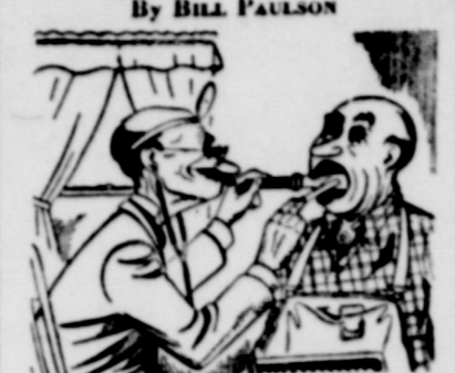
"The bureaucrats think we need the embalming fluid of Socialism when all we need is a blood transfusion of FREEDOM!"