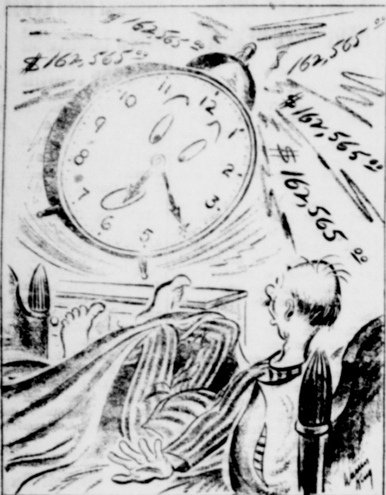
Every minute in fiscal 1953 the Administration plans to spend $162,565 of the taxpayers' money. That is what an $85 billion budget means.

community then held "Build Your Own Home Town" clinics. All kinds of people attended — from women's clubs, the schools, the churches, from all phases of the community's life. Local projects were scheduled on a priority basis and the citizens literally rolled up their sleeves and went to work. New industries began to pop up all over the state; new parks and playgrounds appeared, school and health facilities were expanded and improved; downtown areas were modernized; new job opportunities opened up in more than 100 Arkansas communities.