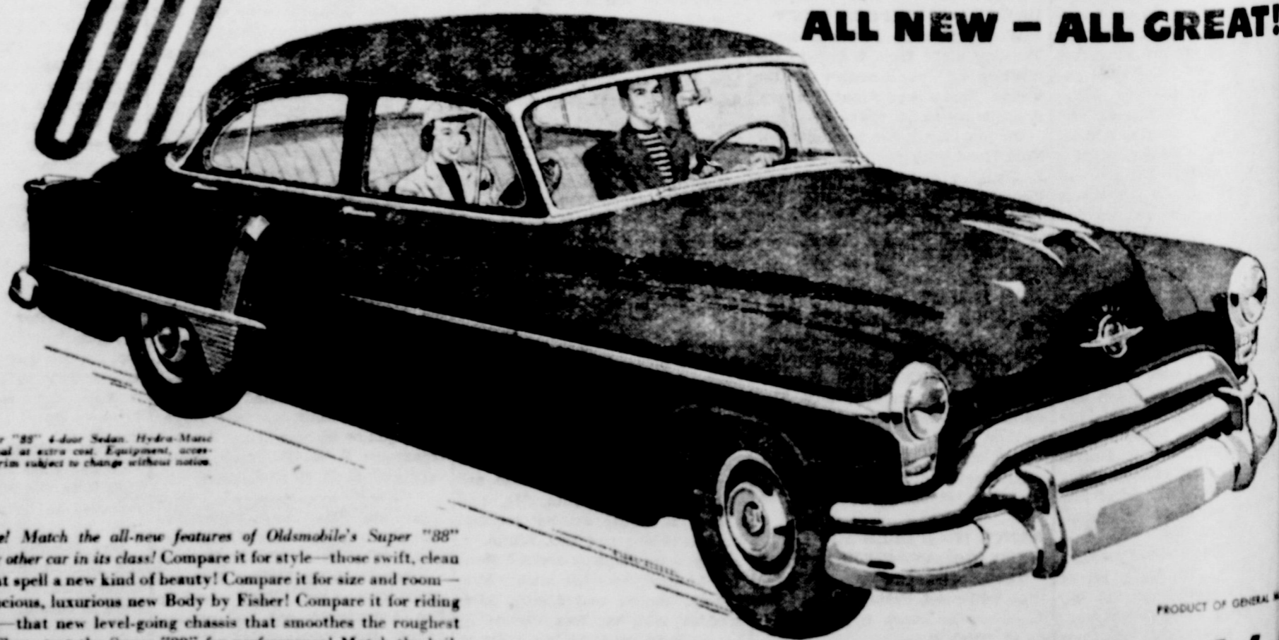
Shown Super "88" 4-door Sedan, Hydra-Matic Drive optional at extra cost. Equipment, accessories, and trim subject to change without notice.

Compare! Match the all-new features of Oldsmobile's Super "88" with any other car in its class! Compare it for style—those swift, clean lines that spell a new kind of beauty! Compare it for size and room—that spacious, luxurious new Body by Fisher! Compare it for riding comfort—that new level-going chassis that smoothes the roughest roads! Then, test the Super "88" for performance! Match the brilliant power and solid gas savings of Oldsmobile's "Rocket" against any other engine on the road! See us for a demonstration ride! Drive the great Super "88" Oldsmobile—newest new car of them all!