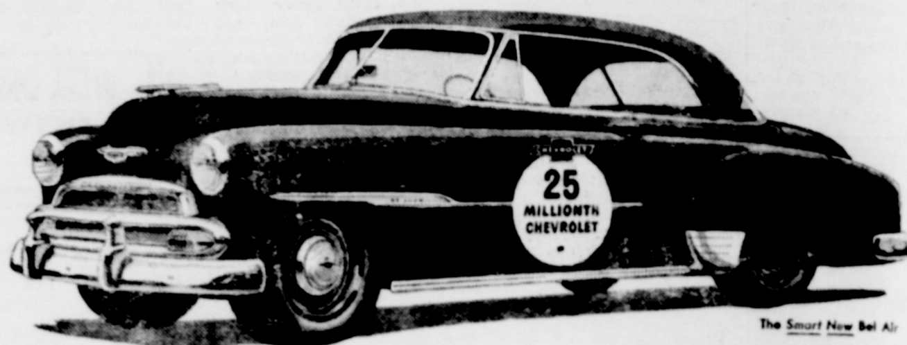
The Smart New Bel Air

Thanks to the Greatest Public Demand any Motor Cars and Trucks Have Ever Enjoyed, the Latest Million Chevrolets have been Produced in Less Than 6 Months . . . Compared to 12 Years for the First Million!