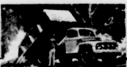
All heavy duty F-5 and F-6 Fords for '51, like this Dump, give you easier, quieter shifting with new, 4-Speed Synchro-Silent transmission, optional at extra cost.

You'll find these new features in engines, clutch, transmissions, axles, wheels, cabs, Pickup body—wherever there have been opportunities to make