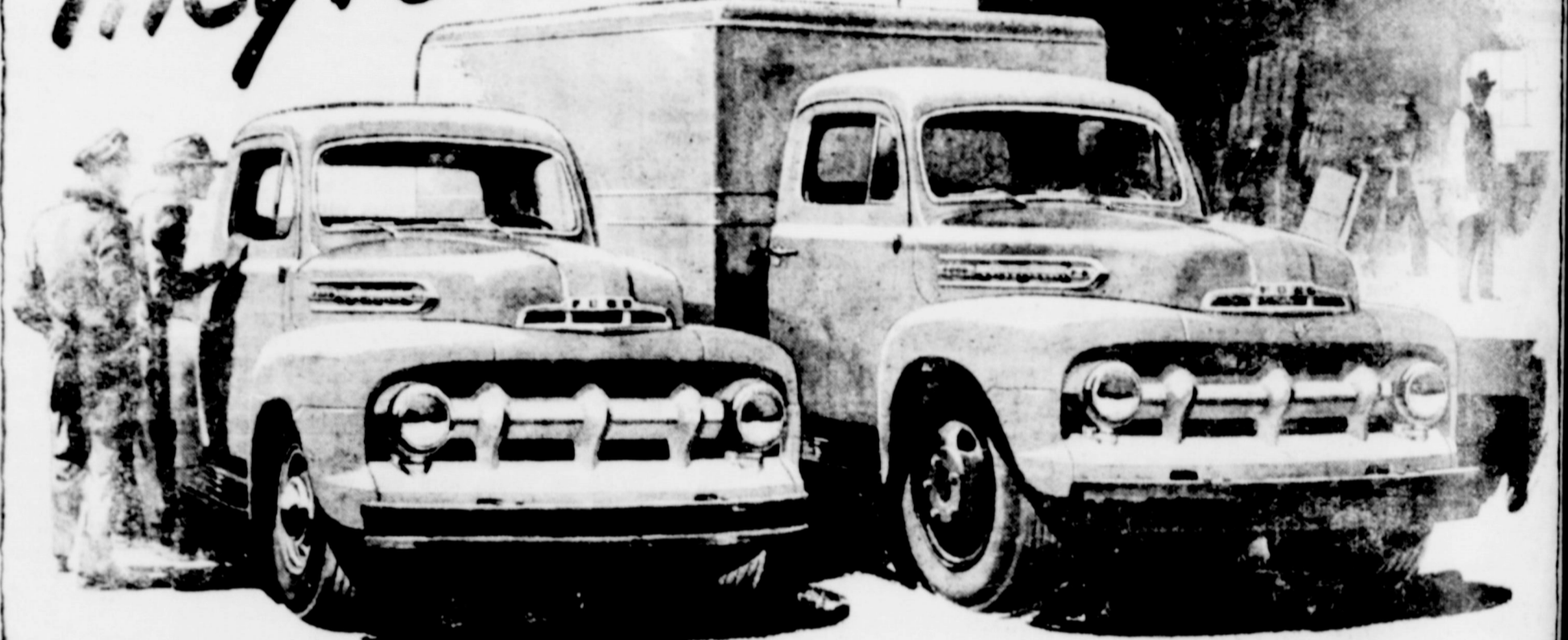
The famous F-1 Pickup... with new features for '51! Plus an important money-saving advancement... the Ford POWER PILOT, standard on ALL new Ford Trucks for '51, from 95-h.p. Pickups to 145-h.p. BIG JOBS!