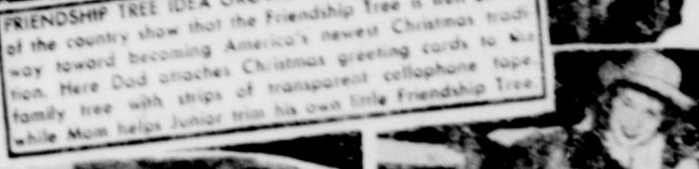
FRIENDSHIP TREE IDEA GROWS —Reports from all sections of the country show that the Friendship Tree is well on the way toward becoming America's newest Christmas tradition. Here Dad attaches Christmas greeting cards to his family tree with strips of transparent cellophane tape, while Mom helps Junior trim his own little Friendship Tree.