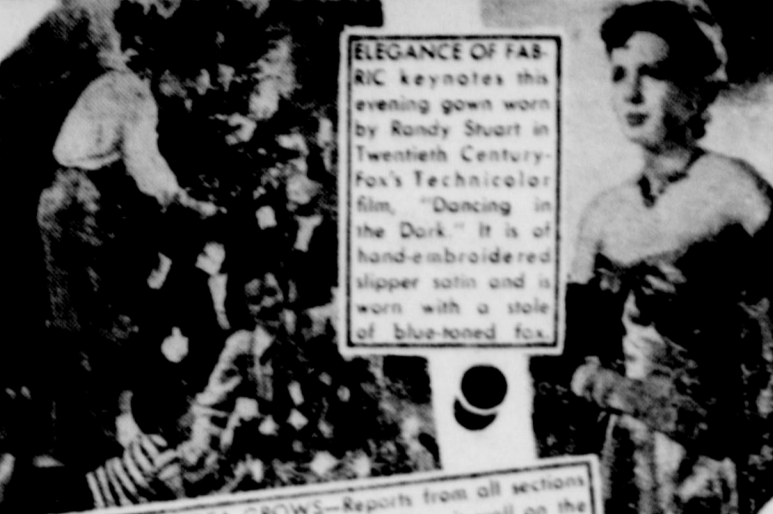
ELEGANCE OF FABRIC Keynote this evening gown worn by Randy Stuart in Twentieth Century-Fox's Technicolor film, "Dancing in the Dark." It is of hand-embroidered slipper satin and is worn with a stole of blue-toned fox.