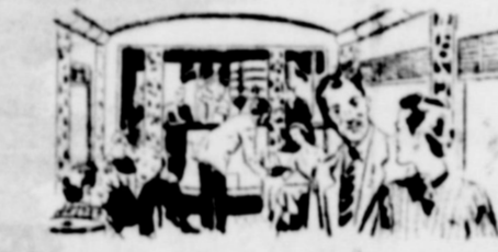
FRENCH QUARTER LOUNGE