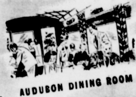
AUDUBON DINING ROOM