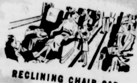
RECLINING CHAIR CAR