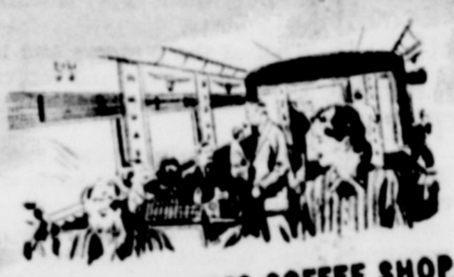
PRIDE OF TEXAS COFFEE SHOP