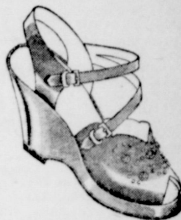
A practical offside sandal with a distinctive design. Elk, red or black $4.95

Just a few of the many styles are shown — more to choose from. Our RED GOOSE Shoes for Children are here so come in today for best selections.