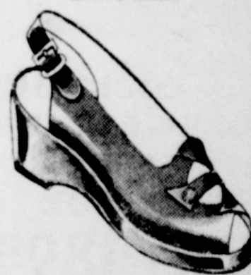
Here is comfort mated with fashion. Black, red or white.