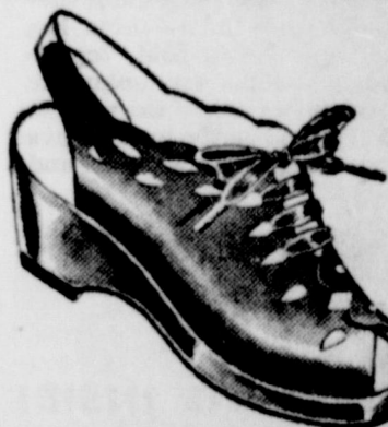
A new fashion story for springtime casual wear in black or white. Size 4 to 10. $3.95.