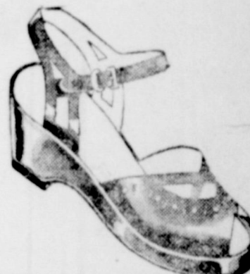
Smartly styled and smartly priced at $4.95. Elk or Black

Put your best foot forward in a pair of these perfectly fashioned flatties. — Only $2.98.