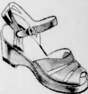
Be thrifty, be fashionable, be comfortable from morning to night in this sandal. Black or natural. $3.95

A spectacular strap that lends a note of charm to your pretty ankles. Elk or white. Only $4.95.