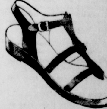
As merry as your favorite flower. Black, red or white. $2.98.