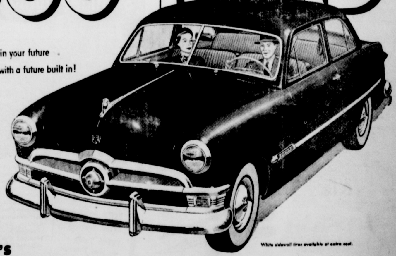
White sidewall tires available on extra cost.

See... hear... and feel the difference at your FORD DEALER'S