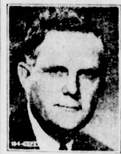
Beauford H. Jester

Monday morning the State of Texas was shocked at the report of the sudden death of Governor Beauford Jester.