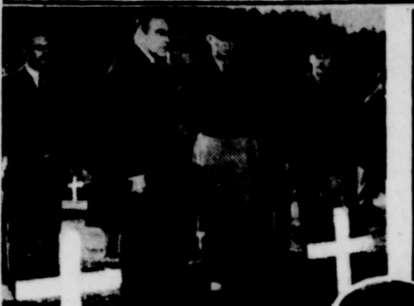
EISENHOWER AT PATTON'S GRAVE—General Eisenhower (center) and members of his party visit the grave of General Patton, Jr., at the cemetery in Hamm, Luxembourg, during the Chief of Staff's recent trip to Europe.