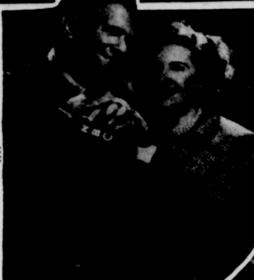
CELEBRATING TEAM—George Burns beams approvingly at his high-spirited wife Gracie Allen as they celebrate their fifteenth anniversary on the air and their second year as stars of NBC's Thursday night "Maxwell House Coffee Time" this season.