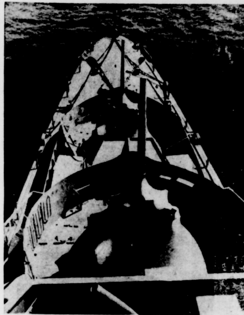
A Navy destroyer-escort, attached to the inactive fleet, is shown "zipped-up" for peace, at Green Cove Springs, Fla. As protection against rust, the two forward gun mounts are spun with film-like coverings made of special plastic.