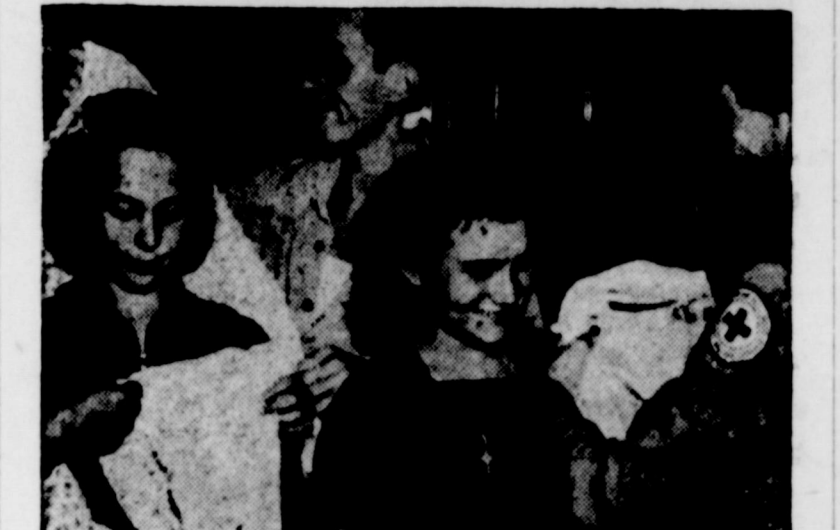
WAR VICTIMS—Millions of garments, large quantities of food; and many medical supplies are provided by the Red Cross for destitute civilians ravaged by war.