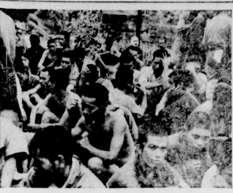
Here is one group of the large number of Japs on Okinawa who chose to surrender rather than to be killed or to commit hara kiri. Those who surrendered were poorly garbed and emaciated, but the fact that so many chose to give up indicates a possible change in the Jap viewpoint on surrender.