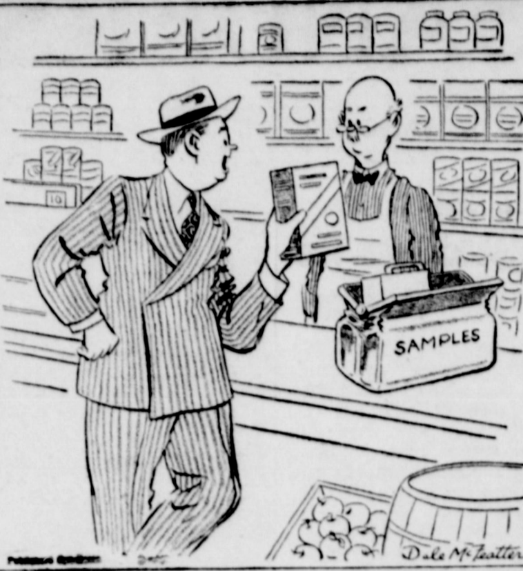
"This new breakfast cereal not only snaps, pops and crackles but whistles 'Oh what a beautiful morning!'"