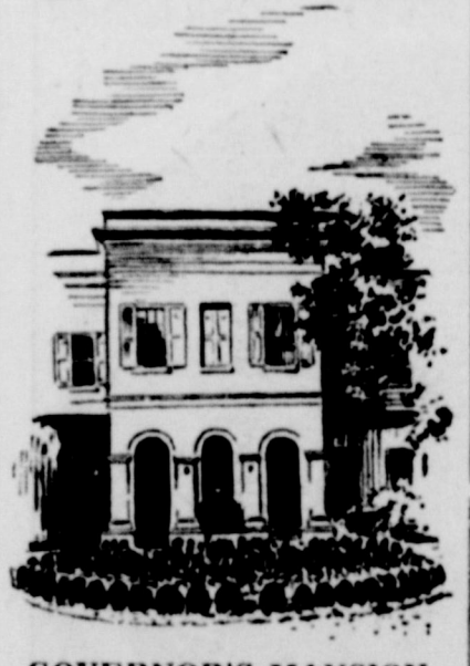
GOVERNOR'S MANSION South Carolina's governor's man-

sion at Columbia is clothed in hisand romance that links the old and the new Souths. Built in 1855, it was originally the officers' barescaped the fire that swept part of the city that year and through the War Between the States unscathed. Simple in construction, it is cooled by dense foliage of the beautiful trees snuggling close. War against injury to this historic gem and will guard it safely to peace.