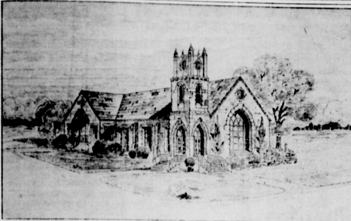
NEW METHODIST CHURCH—

Pictured above is the artist's conception of the new $15,000 First Methodist Church for Sanderson which is now under construction. Shown on the drawing is only one window at the