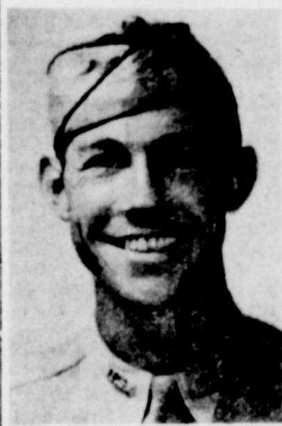
STATIONED IN LOUISIANA

"The continuing manpower demands of the armed forces and the manpower needs of war production and agriculture, plus fairness to men already serving in the armed forces and to men, including fathers, who will soon be inducted, make it imperative that every man acceptable to the armed forces, who knowingly becomes delinquent, should be promptly made available for service in the armed forces or prosecuted under the terms of the law," General Page said.