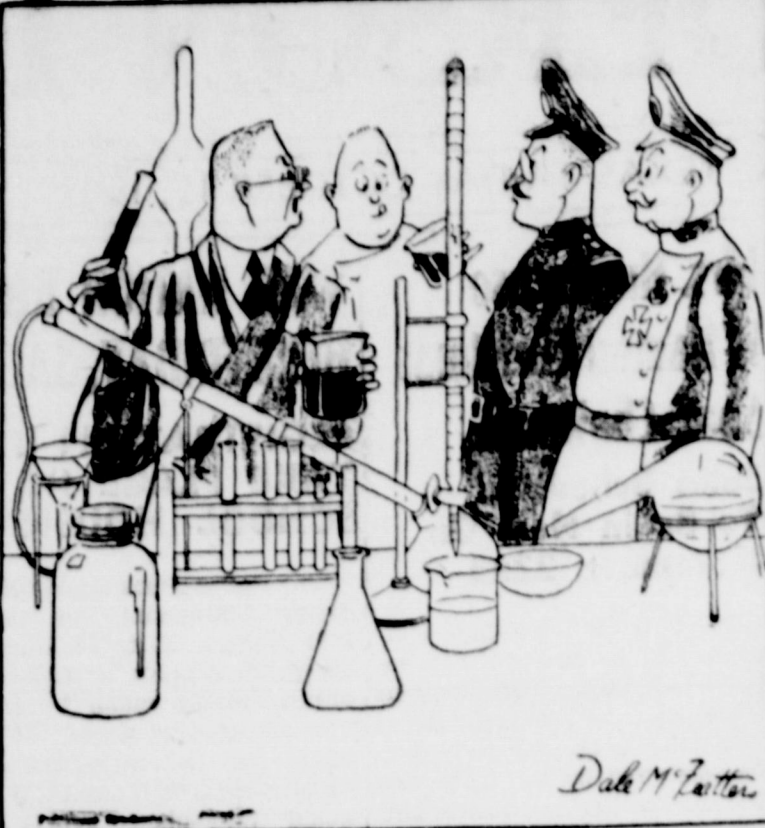
"Are you certain our spies stole the correct formula for the enemy's new explosive? It keeps coming out a chocolate malted milk!"