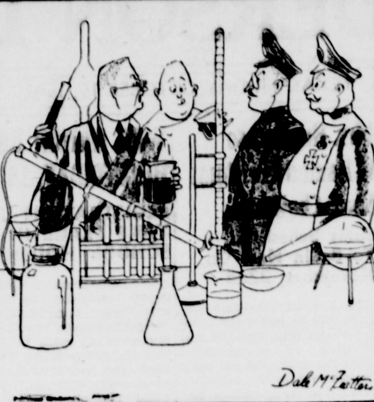
"Are you certain our spies stole the correct formula for the enemy's new explosive? It keeps coming out a chocolate malted milk!"