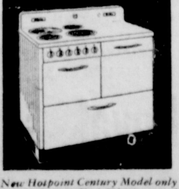
$109.95 installed. Thirty equal monthly payments. Allowance for your old stove.

day, see our display of new electric ranges and get the facts about today's electric cooking. When you learn how little it costs to cook electrically-how it saves you time, trouble, money -you, too, will join the switch to switches.