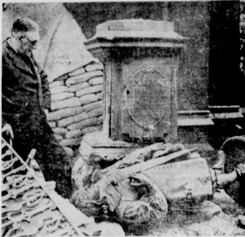
The statue of John Milton, the famous blind poet of Great Britain, is toppled from its pedestal by a Nazi bomb that fell on St. Giles, one of London's oldest churches. In the churchyard lies the tomb of the great poet. The interior of the church itself was also damaged by the blast.