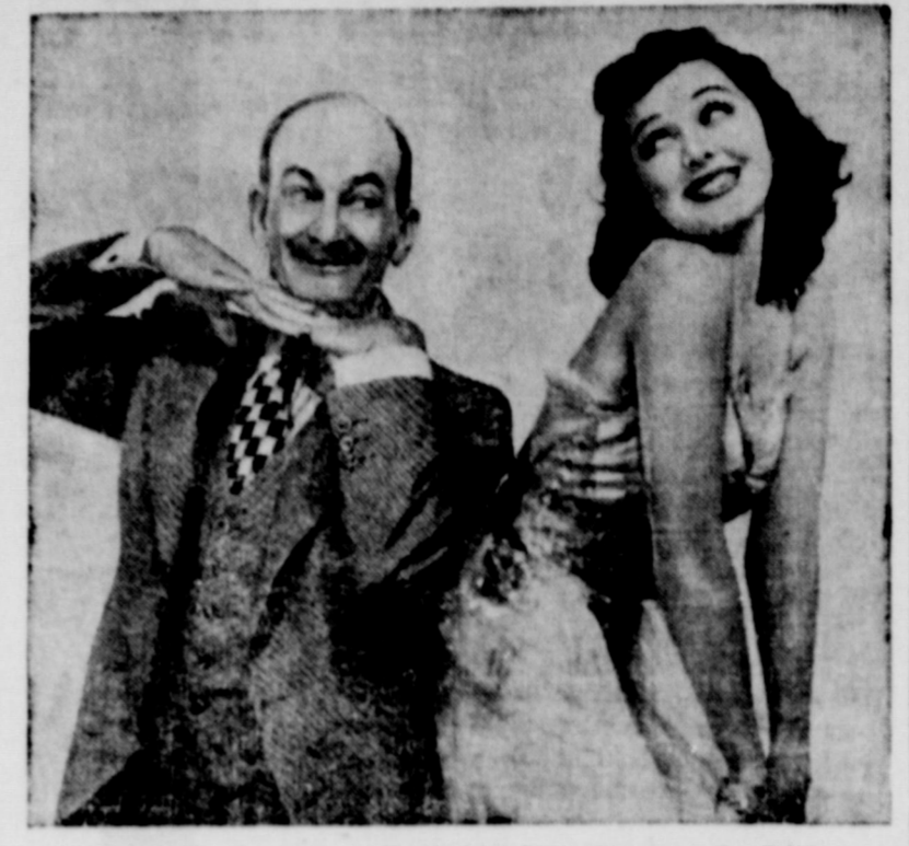
Leon Errol and Ann Rutherford in "Dancing Co-Ed"