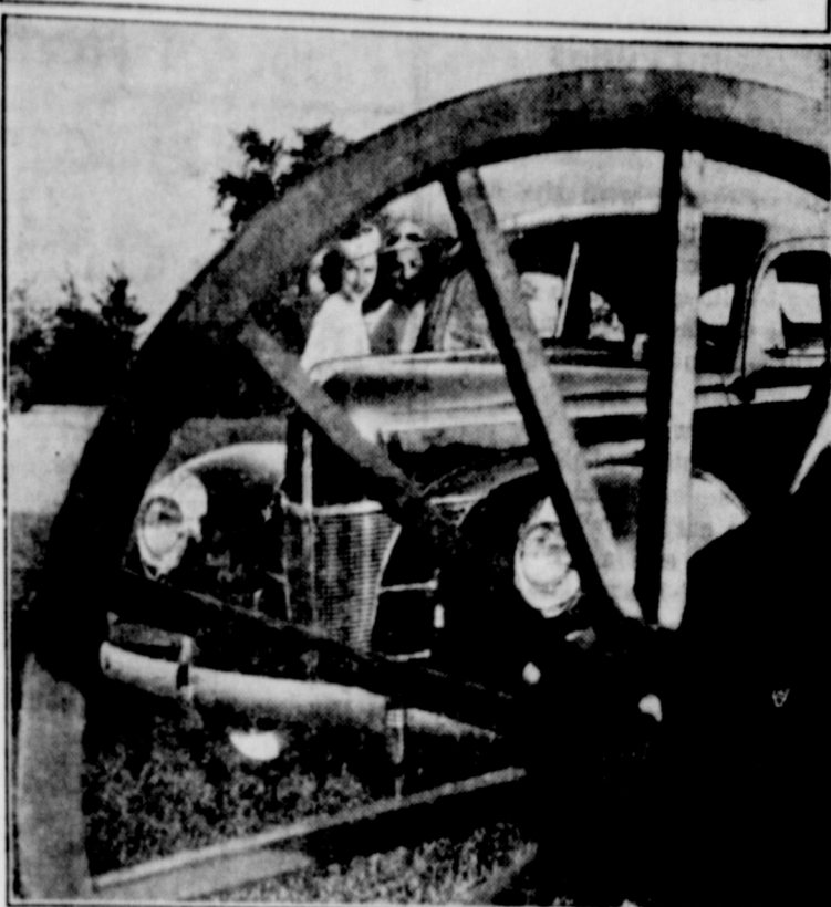
THE wheels are turning at the big Ford Rouge plant and off the assembly lines are rolling these new Ford V-8 cars for 1940. Illustrated is the front end of the deluxe Ford V-8. The new cars are big, substantial and powerful in appearance. Front end designs are distinctively modern, bodies gracefully streamlined. New features include a finger-tip

gearshift on the steering column, a controlled ventilation system, improved double-acting hydraulic shock absorbers and Sealed-Beam headlights. Deluxe cars have an improved spring suspension, softer springs front and rear and a new torsion bar ride-stabilizer. Emphasis in interior styling is on fine appointments and upholstery.