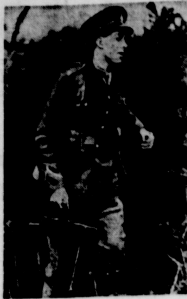
The Viscount Lascelles, eldest son of H. R. H. Princess Mary and the earl of Harewood, is merely another soldier during field day at the Easton college officer's training corps in England.

Object to Woman Bosses Ex-soldiers working in the British civil service are protesting against having to serve under women, one statement saying: "Thousands of wives object to their husbands being 'bossed' by a woman."