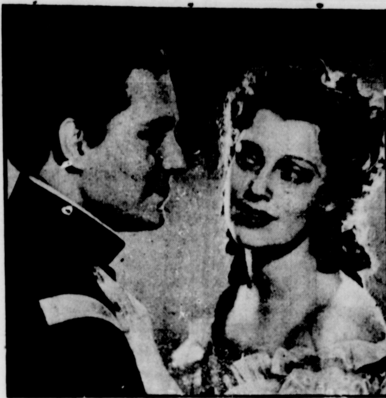
MUSICAL TREAT FOR PRINCESS PATRONS— Above is pictured Jeanette McDonald and Nelson Eddy, co-starring in the romantic musical, "The Girl of the Golden West," coming to the Princess Theatre Monday and Tuesday of next week. The story depicts scenes and happenings of the colorful gold mine camps of 1850 including holdups by bandits and the romantic, gay life of the missions and villages.

BAPTIST CHURCH Sunday School at 10 a. m. Due to absence of a pastor there will be no preaching services.