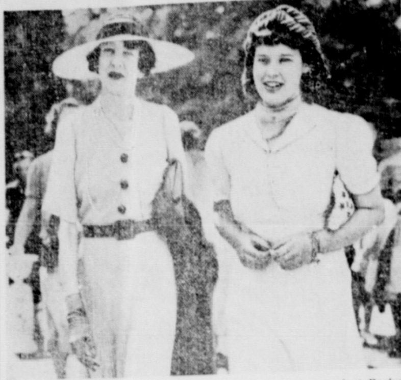
Recently graduated from the exclusive Greenvale school at Roslyn, N. Y., Gloria Morgan Vanderbilt, daughter of Mrs. Gloria Morgan Vanderbilt, is shown with her aunt, Mrs. Harry Payne Whitney, attending the annual open-air fair at Greentree, the Whitney estate at Manhasset, N. Y.