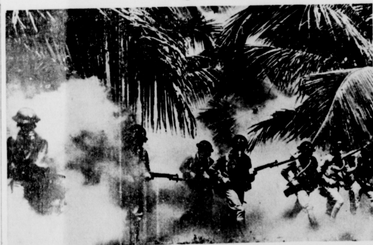
Members of the Sixty-fifth infantry, United States Army, shown during a bayonet charge, protected by a smoke screen during maneuvers near Punta Salinas, Puerto Rico, in preparation for the joint maneuvers to be held in Puerto Rico next winter when the Atlantic and Pacific fleets with the army and coast guard will participate in the most comprehensive war games in recent years.