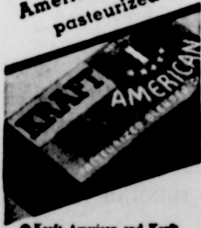
• Kraft American and Kraft Pimento in new package and foil-wrapped leaves.

KRAFT alone gives you FULL natural flavor in packaged American Cheese pasteurized