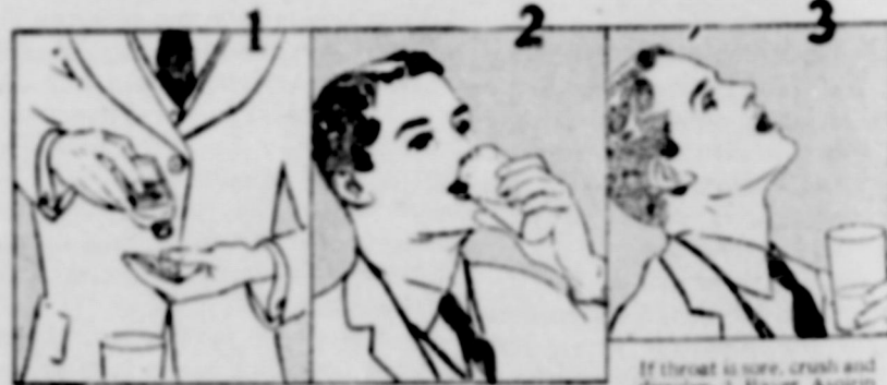
Take 2 Bayer Aspirin Tablets. Drink full glass of water. Repeat treatment in 2 hours.