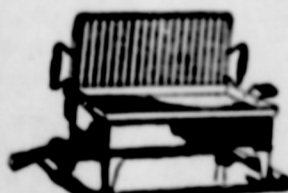
Table Stoves Cook breakfast eggs and bacon right at the table. Toast sandwiches in one and one-half minutes. $4.00—Up

CHRISTMAS TREE LIGHTS per set . . . . . $1.00 up