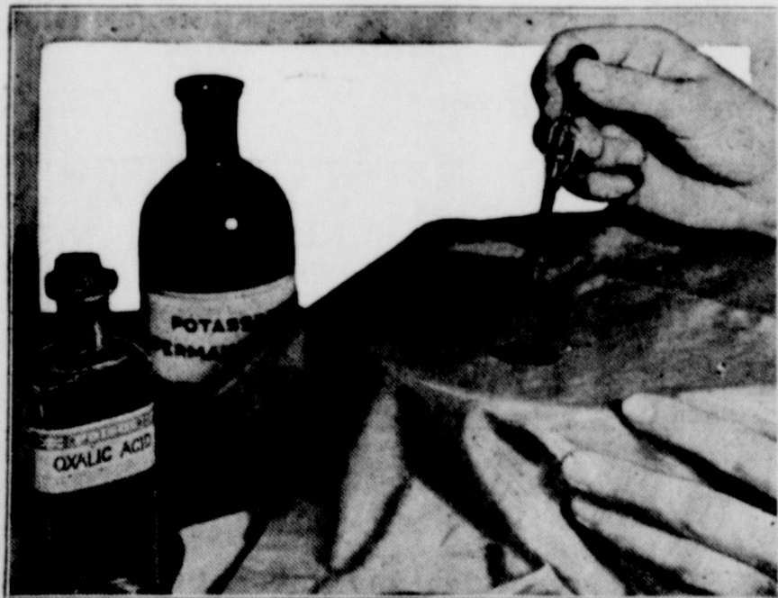
Medicine Dropper Handy When Removing Stains With Chemicals.

(Prepared by the United States Department of Agriculture.) There are a few common chemicals which are necessary to remove stains, and these should be kept in every household. Some of them are poisonous, so don't put them in the family medicine cabinet or in the pantry. The chemicals most frequently needed are Javelle water, potassium permanganate, oxalic acid, ammonia water, and carbon tetrachloride. Keep these out of reach on a high shelf, together with a medium-sized bowl, a medicine dropper, a glass rod with rounded ends, several pads of cheesecloth or old muslin, a small sponge, and sheets of white blotting paper, suggests the bureau of home economics of the United States Department of Agriculture.