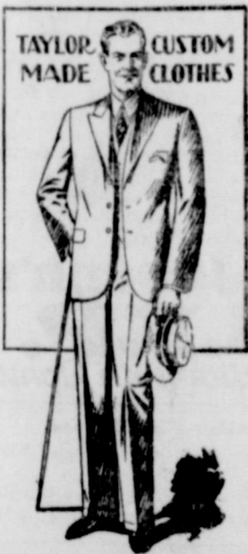
TAYLOR CUSTOM MADE CLOTHES