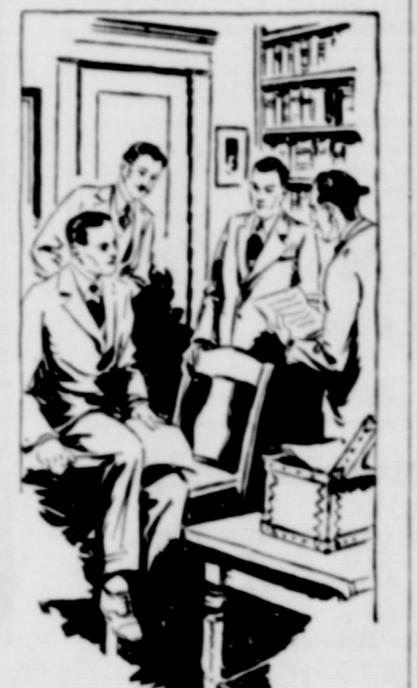
This Was Written by the Widow of the Elizabethan Hugh.

"I had forgotten that," exclaimed Hugh. "It's some more of Lady Jane's poetry."