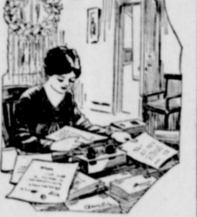
She Read the Note Once more as it Lay on the Desk.

Christmas Day, the day, arrived. When the old folks came down to their breakfast, they found a Christmas tree laden with at least one gift for each.