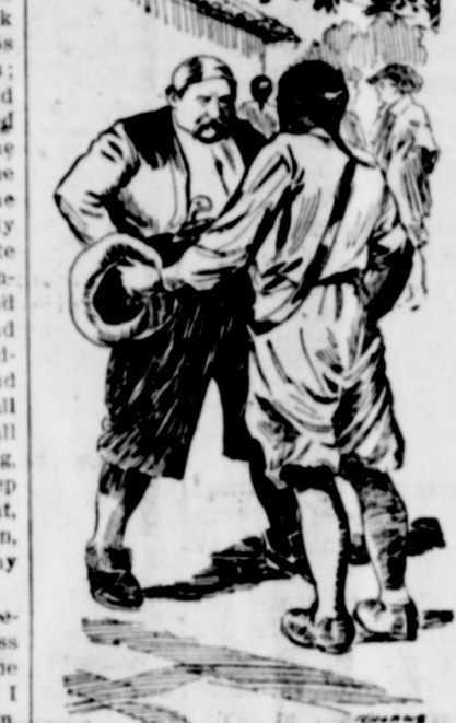
"What the Devil Do You Mean, Sir?"

The remark, however, was unfortunate, for as he uttered it there appeared, to my consternation, above the tops of the distant hills the glowing ball of light, beautifying all nature, but throwing into a pitiless relief the worn and dispirited faces of the crowd of pleasure seekers in its path. In desperation I glanced about on every side for some sign of the absent Quashy, and for a moment, to my delight, I actually thought that I saw a figure in crimson emerge from the strip of woods beyond the track. The next second I thought I saw it rise again, then stumble and lie prostrate. Any chance, however desperate, was worth taking; we had nothing to lose and all to gain, and with a hurried word to George we started at a run across the field. Never in my life have I felt less like a burst of speed, and George's course, I am confident, must have been a zigzag rather than a straight line. Yet we did our best, and presently, with a great throb of