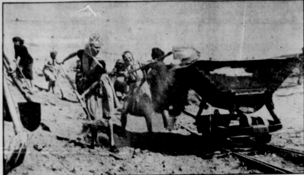
German women laborers shovel dirt into a rail dump car in clearing off the new airfield which the U. S. Army is building in the French sector of Berlin. The Army hopes to complete the field by winter to bolster the Berlin airlift lifeline. Of 1300 German laborers hired for the job, three out of every four are women.