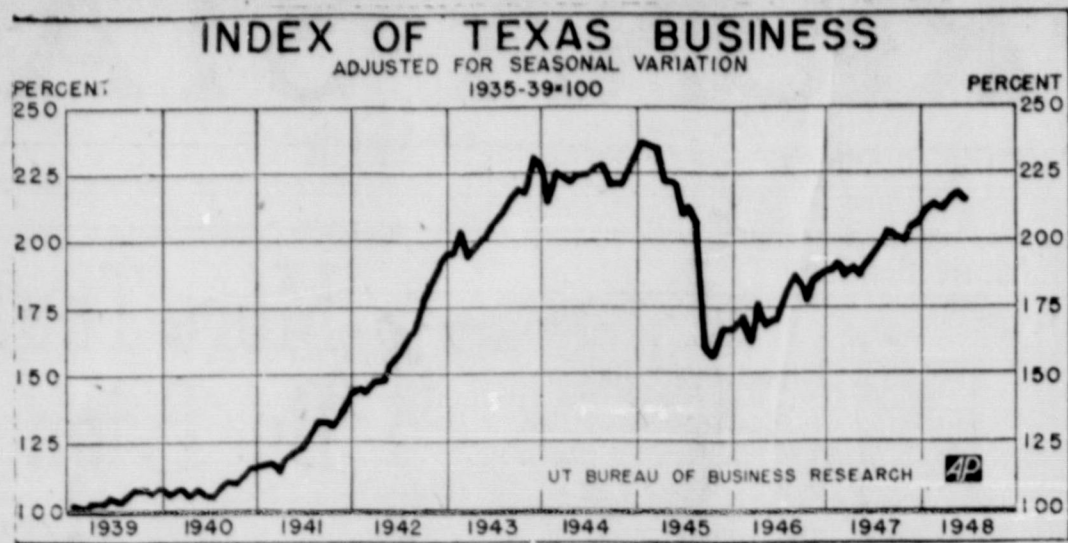
June business in Texas was still at the peak of the postwar boom, although the composite index of business activity, compiled by the University of Texas Research Bureau of Business Research, edged slightly below its May level. The Bureau's seasonally-adjusted index of Texas business was 216 per cent of the prewar (1935-39) level, 217 in May 1948, and 190 in June 1947.