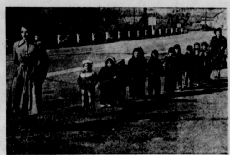
KNOTTY SOLUTION TO PROBLEM . . . Mothers of Kennedy Township area of Pittsburgh came up with this solution to problem of keeping children from darting into traffic. Gimmick is clothesline with a knot for each child, which keeps each child in a safe place.