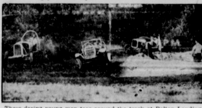
These daring young men tear around the track at Bolton Landing, N. Y., in 1920 racing jalopies just for the thrill of it. There are plenty of spills, rolls and chills, but so far—amazingly enough—no one's been burt in the daredevil sport.