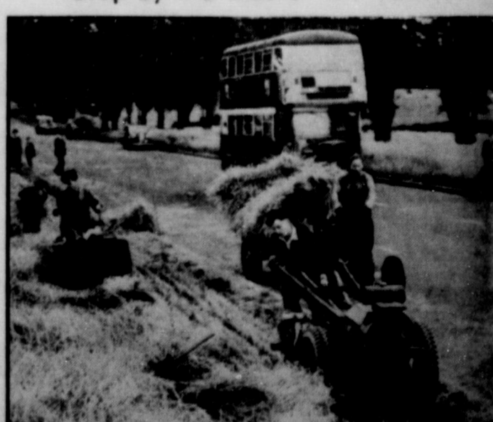
At South Mimms, Englar , just 1. man from central Lond eight acres of crops are being harvested with tractors. The harv is part of an experiment with roadside green land, where me tons of food might be grow. At English tractor firm spons the ventu.