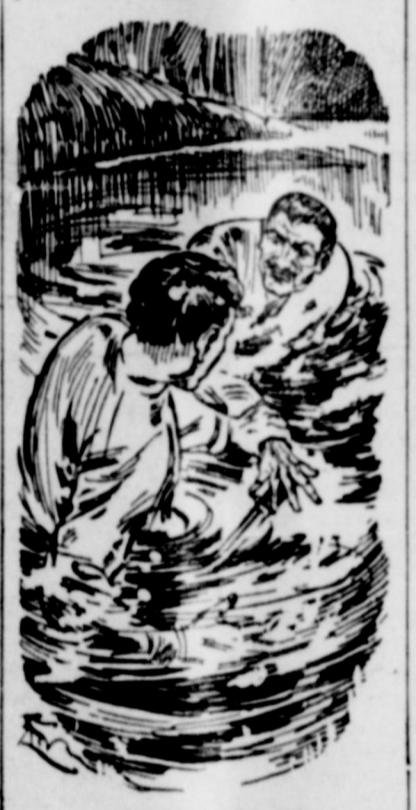
"No Mercy Now!"

"Monsieur," she said, "I cannot find it in my heart to hate. It is the poison. Many times you were kind, and I remember them." He bowed his head, and through his tangled lashes looked up at Drace, fire gleaming through brushwood. But he spoke to Nadine, turning upon her a less malignant glance. "The paralyze, it begin down here an' creep up. When it touch the heart, I was go. I say just now that Tony, he would kill the strong monster. He would not. He be scared when I was done." "Your name, leetle gel," pursued Stepho, "was Walton—the daughter of a northern man who live in the same town with Mr. Drace's father near Cincinnati. You an' your mother were carried off by my men; but your mother, she fall from the horse just as we come to our camp and she die. About her neck was a purse with money and papers—one that tell where more money is buried. After the war I go back and dig up this money, but I keep it for you, for your dowry. It is here—buried under the hearthstone." Now—now I beg you to go for Father Taban. You know where he live. Quick, for it creep up." "Yes, I will go. Virgil will stay to keep you company." "Let me go with you," Drace pleaded, fearful that some harm might befall her. "No, my love's one," she gently opposed him. "You must stay here for